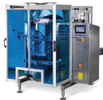
WeighPack’s XPdius Elite i130 is the latest addition to International Foodsource’s packaging line.

The PrimoCombi multi-head weigher is the first CAN-BUS wired combination scale that houses all electronics from one central electrical enclosure, hence offering serviceability advantages that no other manufacturer in the world offers. Its PC controls and Windows operating system include WIFI and are embedded with Crystal Reports, Skype, LogMeIn.com for free online support and more. The Primo360 software installed to operate the weigher comes bundled with reporting software that offers effective yield and cost control management. The bar code scanner easily recalls product setup so going from one product to another or one size to another takes seconds regardless of the level of operator training. Clean up time is reduced to a min-